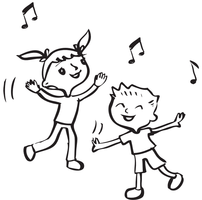
Con mis orejas yo escucho.