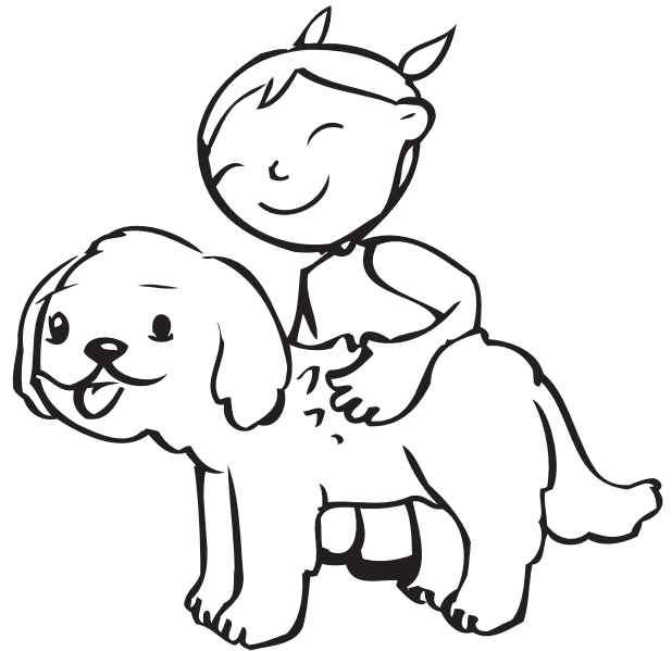
Con mis manos yo toco.